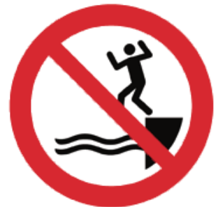
No jumping into the water