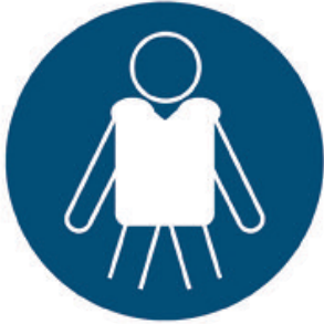
Wear a life jacket