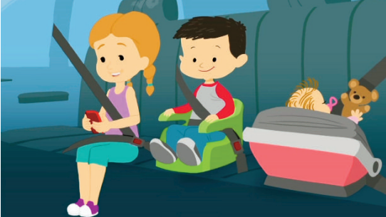
Seat belts, car seat